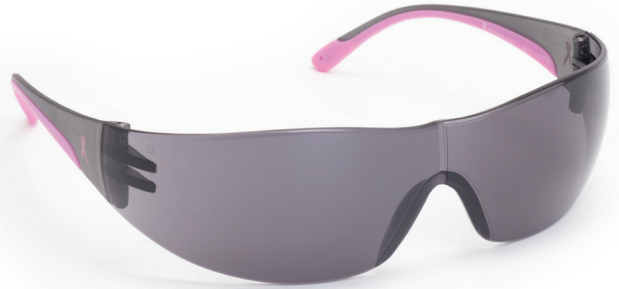
NBCF28E - SMOKE