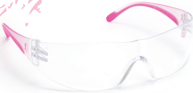
NBCF27E - CLEAR