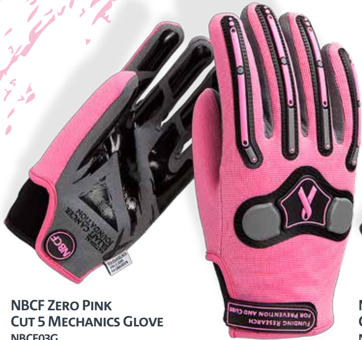
NBCF ZERO PINK CUT 5 MECHANICS GLOVE NBCF03G