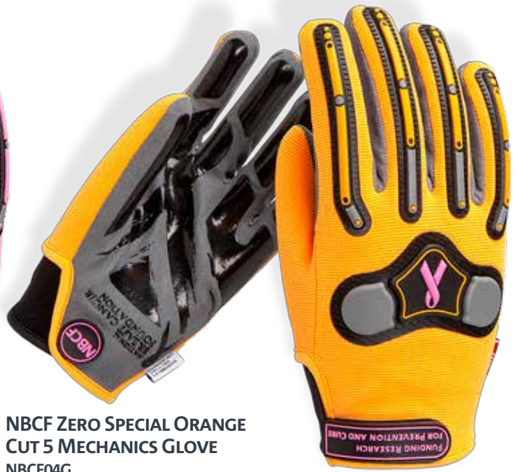
NBCF ZERO SPECIAL ORANGE CUT 5 MECHANICS GLOVE NBCF04G